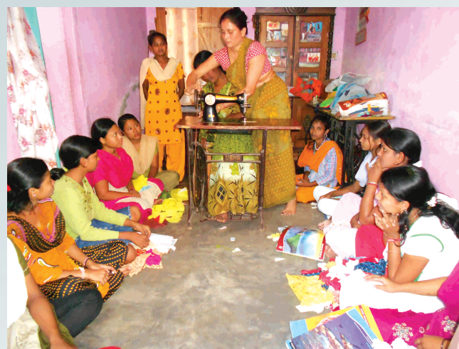
Training on Cutting and Tailoring at Rangiya Tiniali, Kamrup.