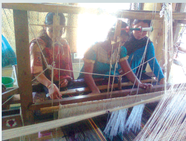
Weaving Training at Chandrapur, Kamrup (M) in collaboration with College of Engineering & Leather Technology, West Bengal.