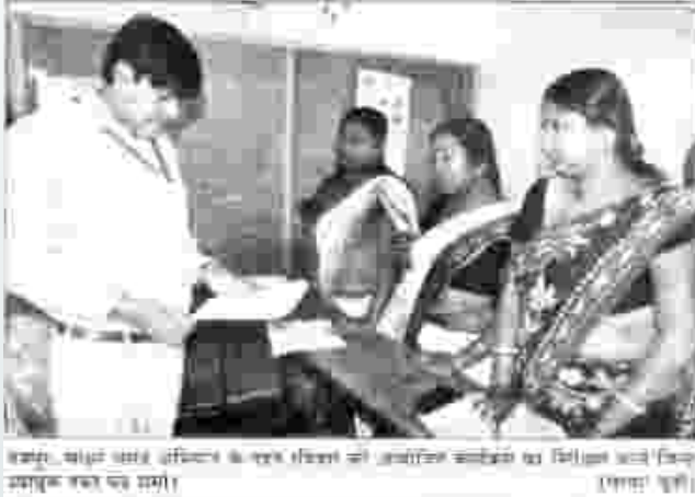
Published in 'Dainik Porboday' from Guwahati, Monday, 18th March